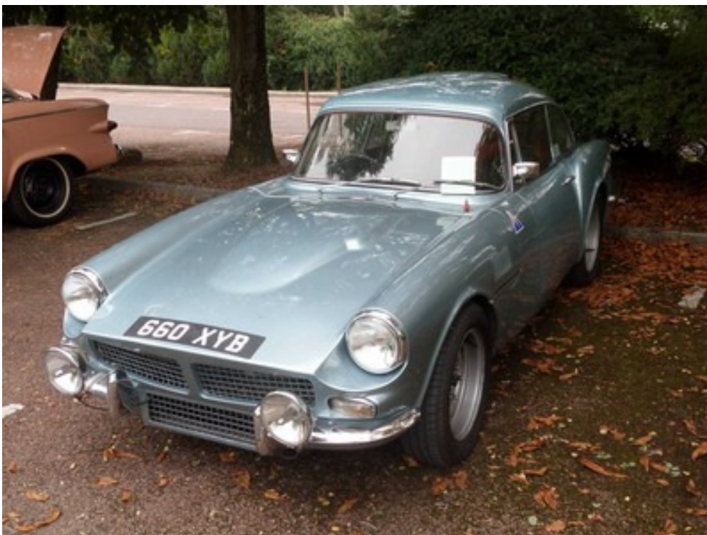
A great looking Sabre